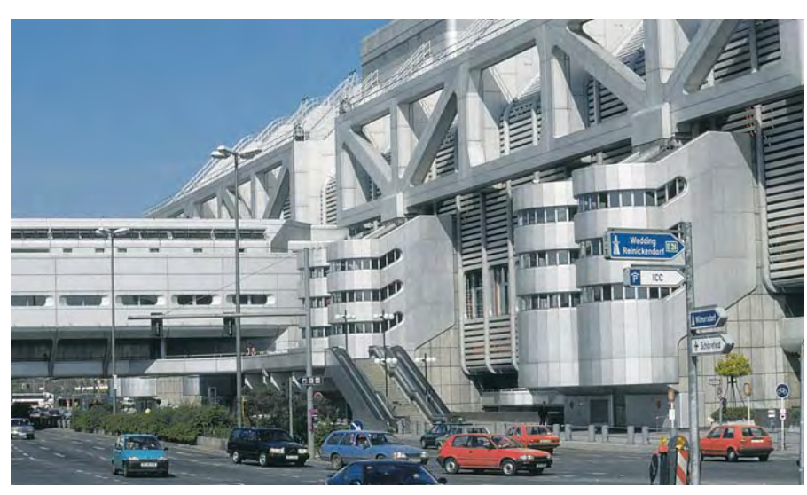
Complex HVAC building services automation solutions