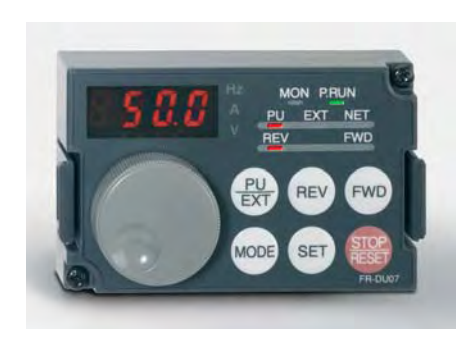
Control unit FR-DU07