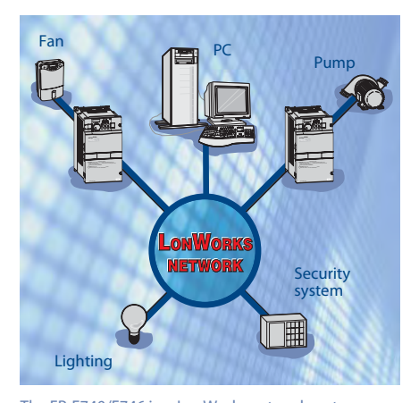
The FR-F740/F746 in a LonWorks network system